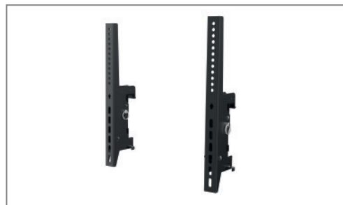
VESA arms, tiltable, max. VESA 400 mm