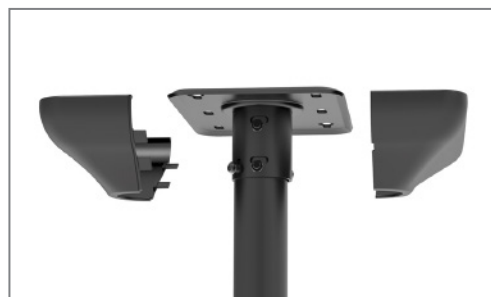
neat ceiling finish