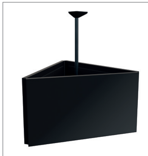
Screen content visible all around